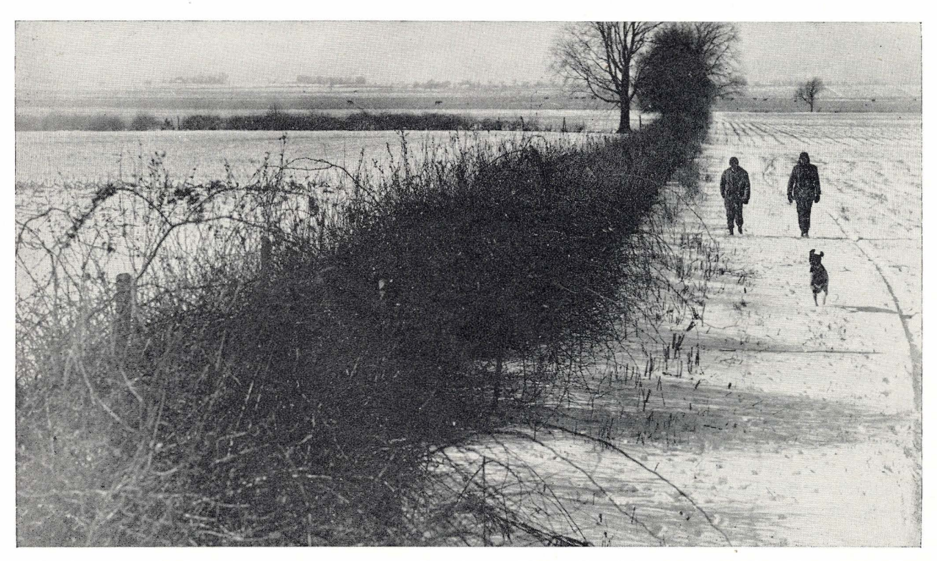
The above picture illustrates the amount of escape cover offered to our wildlife with a living fence of Multiflora Rose, which neither man nor dog can penetrate. This fence also offers an abundance of reserve winter feed as well as a stock-proof barrier.

It was impossible to supply the demand for the