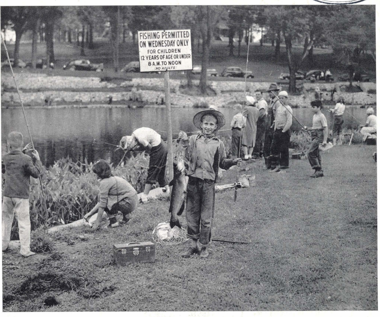
Kansas Helps Its Teen-age Fishermen